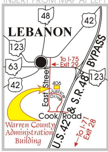
Map Prepared By: Warren County Regional Planning Commission